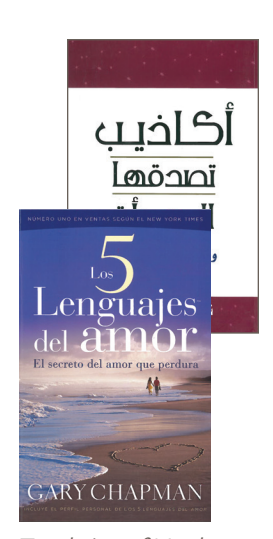
Translations of Moody Publishers books include Lies Women Believe in Arabic and The 5 Love Languages in Spanish.